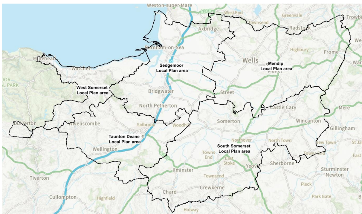
Table 1 lists the adopted Development Plan documents for Somerset Council. The documents can be viewed at https://www.somerset.gov.uk/planning-buildings-and-land/adopted-local-plans/

This means that the existing Development Plans of the former council's will remain in place for their relevant geographical areas of Somerset Council until they are replaced by one or more Development Plan documents.